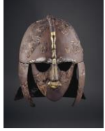
Invaders and Settlers