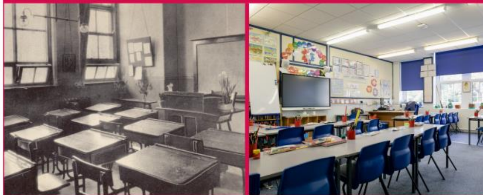
What is different?